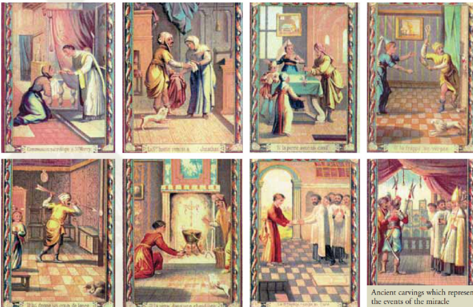
Ancient carvings which represent the events of the miracle