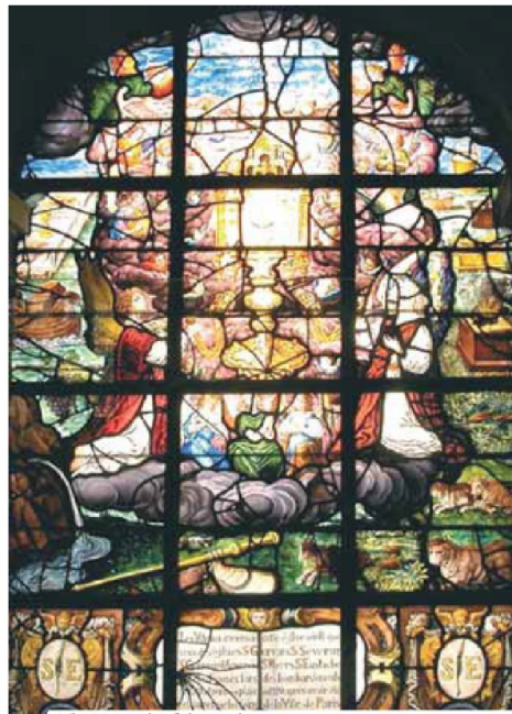
The Triumph of the Eucharist