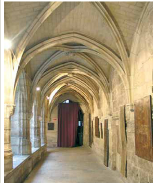
Cloister des Billeteries which has today become a Protestant church