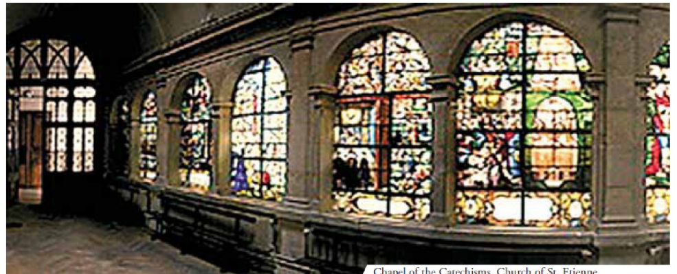
Chapel of the Catechisms, Church of St. Etienne

Desperate, he threw the Host into boiling water and the Host freed itself from the water hovering in mid-air and then taking the form of a crucifix.